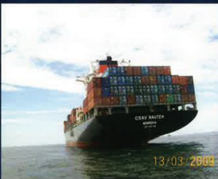
6 MV CSAV Rauten - by Capt. Corneliu Vasiliache