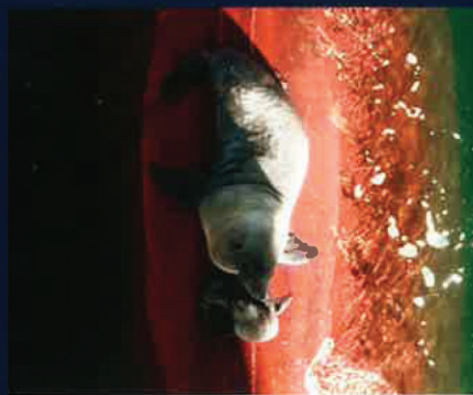
15 Sun bathing seals on MV MSC Kiwi