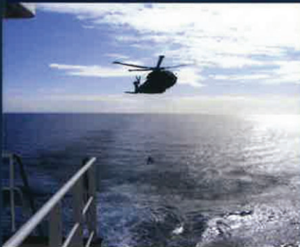
1 Helicopter drill on MV Lehmann Timber

We look forward to receiving even more pictures and movies from on board in 2010!