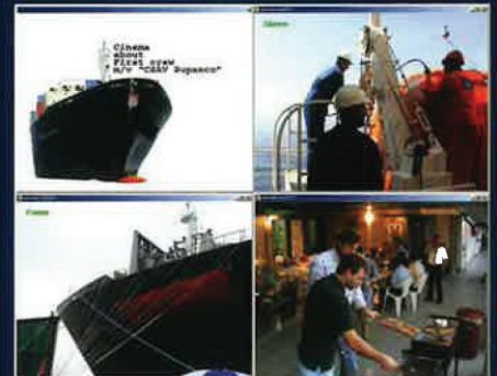
3 Cinema: first crew on MV CSAV Rupanco