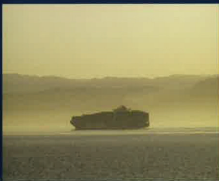
14 The misty bay taken on the Suez bay