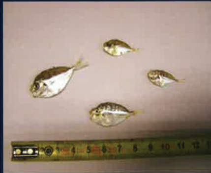
10 Filterfish - by C/E Joerg Krueger