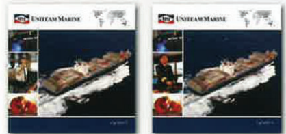
UNITEAM MARINE career flyer – European and Asian version