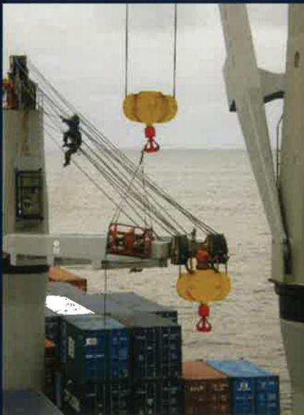
7 Working in the air on MV Helene Rickmers