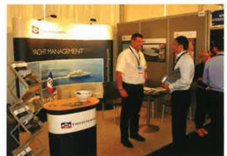
Discussions at QP 36 - the stand of UNITEAM YACHTING

This event is the biggest yacht show in the world, with 500 exhibitors plus 100 large motor/sailing yachts and another 50 exhibitors on the waiting list. 30,000 visitors were expected to attend.