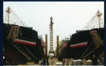
5 Naming ceremony MV Northern Jubilee & MV Northern Jasper