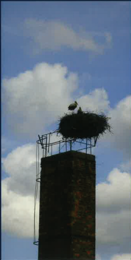
9 Storks in their nest on old farmhouse near Rostok