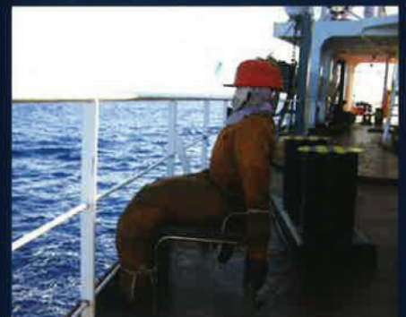
8 Additional anti piracy measures on MV Clipper Emperor - by Capt. Myat Ko Ko