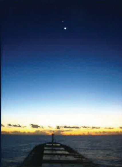
2 Smiling sky - by C/E Viktor Karlashevych