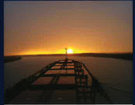
13 Sunset taken during river passage to San Lorenzo