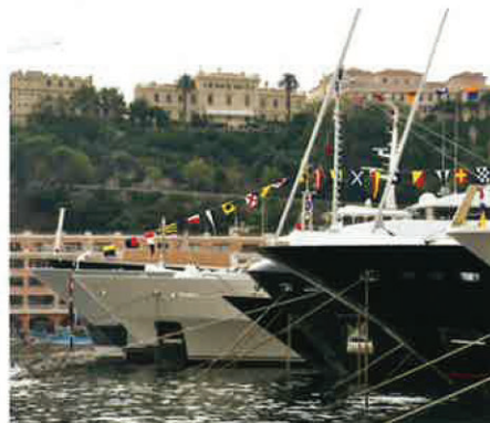
Motor yachts at Port Hercule

The 19th Monaco Yacht Show took place from 23 to 26 September, under the patronage of His Serene Highness Prince Albert II of Monaco.