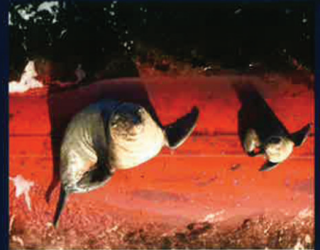
11 Family of seals in Melbourne on MV MSC Kiwi - by trainee fitter Aung Kyaw Thu