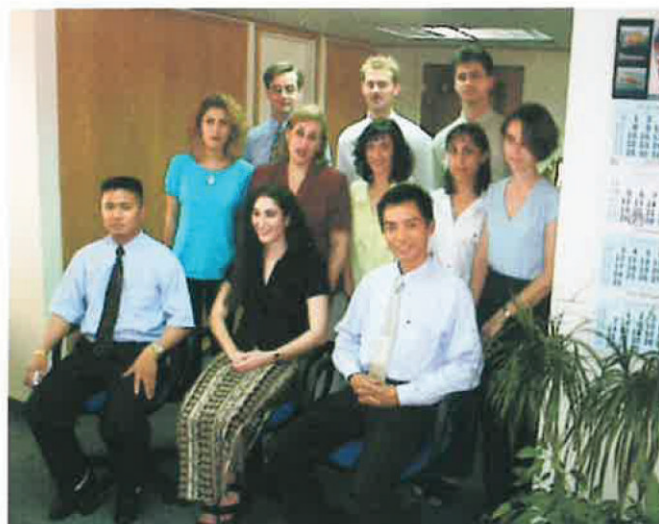
Fleet Personnel Department: from left to right and forward to aft.

It has always been the policy of Uniteam to adhere to quality in ship management and since its early days, the company is growing under a steady expansion scheme, so as to direct personalised care and attention to each and every client and vessel under its operations. In its effort to attain quality, Uniteam decided in 1994 to proceed with the certification of the Company under the ISO 9002 Standard and the ISM Code and with the active involvement of all office and shipboard personnel this was successfully achieved in June, 1996.