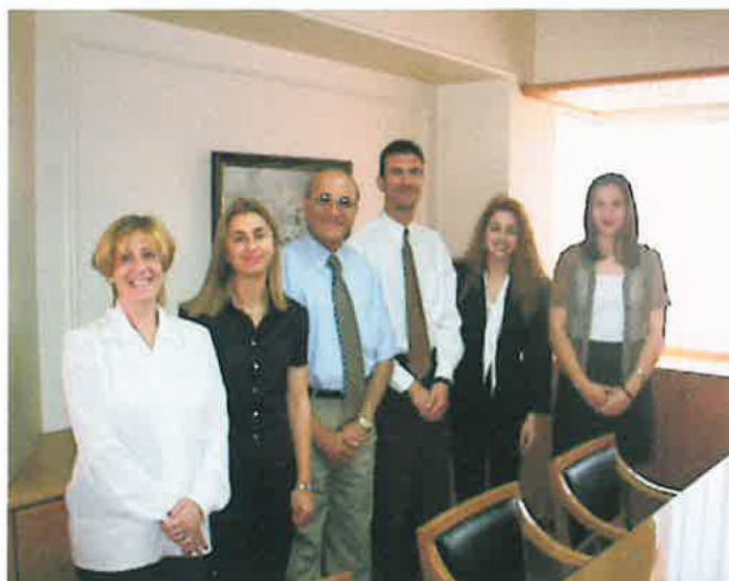
Operations / Administration department:

In consideration of the company's needs for experienced and qualified crew, Uniteam has placed particular emphasis over the years on training of crew and therefore the office in Yangon was also established, overseeing the training and recruiting of all our Myanmar personnel.