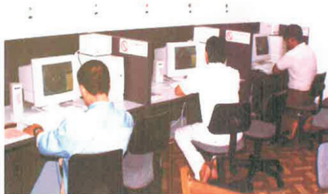
ARPA Course in Yangon. Equipment and software co-sponsored by Uniteam.

Similarly, in March 1999, Uniteam Yangon has jointly sponsored an ARPA training centre at the premises of the Institute of Marine Technology.